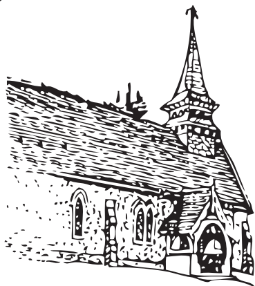
St. Lawrence, Westcott Parvich