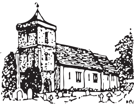
St. Mary's, Herriard