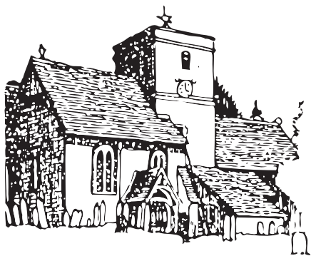
St. Mary's, Upton Grey