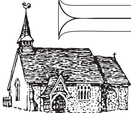
All Saints', Turworth