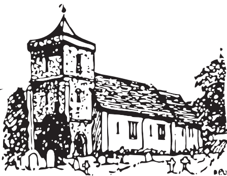
St. Mary's, Herriard