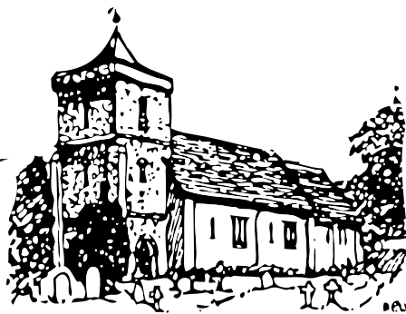
St. Mary's, Herriard