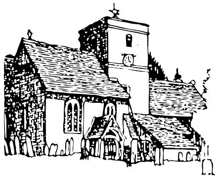
St. Mary's, Upton Grey