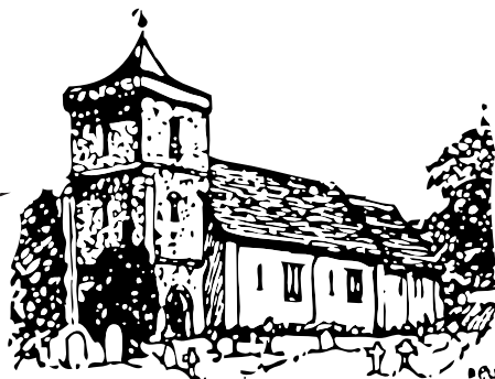
St. Mary's, Herriard