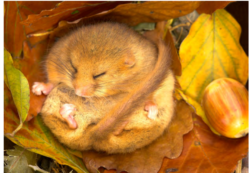
Hibernating Hazel dormouse