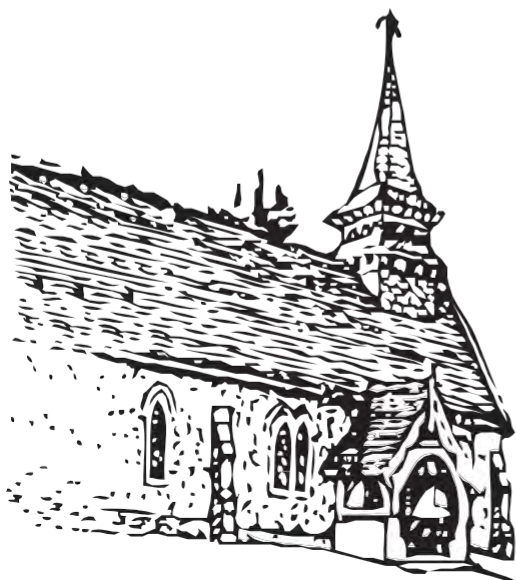
St. Lawrence, Wiston