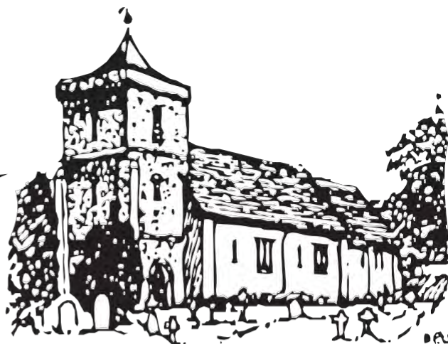
St. Mary's, Herriard