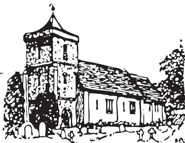
St. Mary's, Herriard