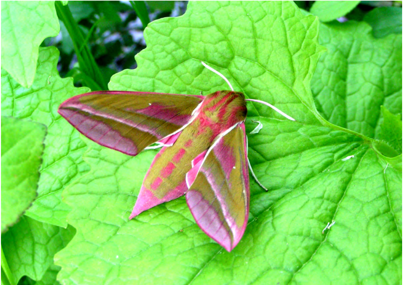
Elephant hawkmoth