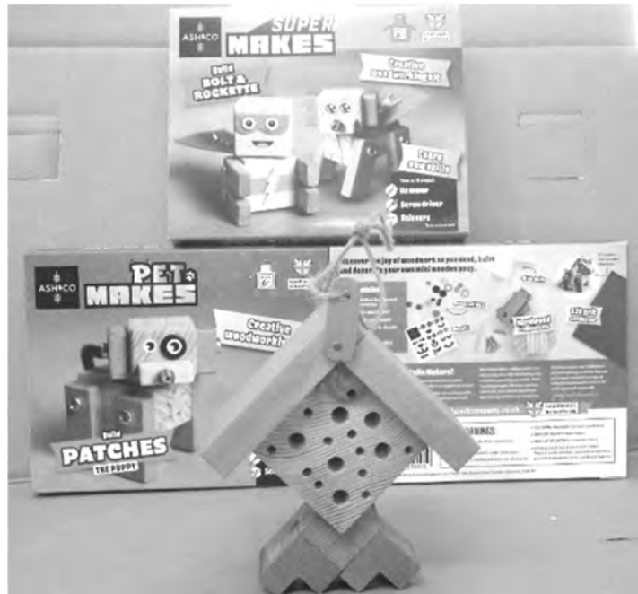
Organ heritage bird nest box (left) and different 'Pet makes': Patches the dog, Perrie the pony and Bolt and Rockette (right)