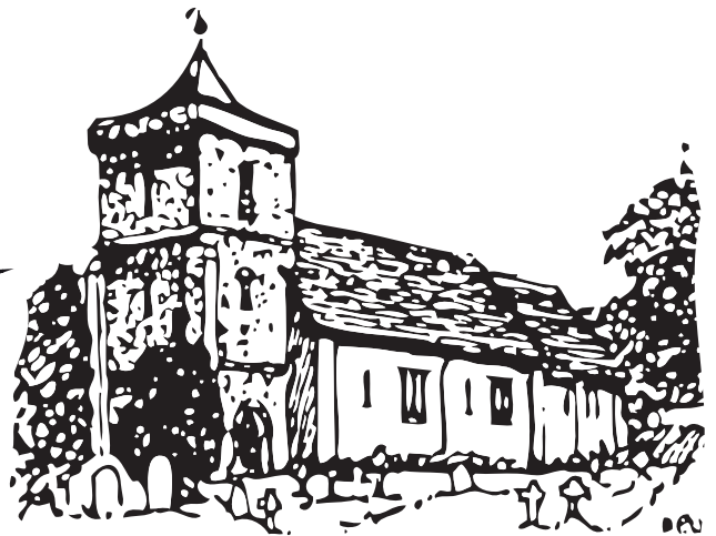
St. Mary's, Herriard