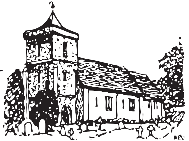
St. Mary's, Herriard