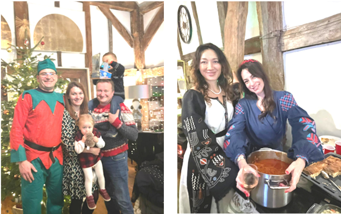
Ukrainian families and hosts celebrating 'Holy Evening' together

More than 120 Ukrainian refugees (or, as we like to refer to them, guests) have made their temporary home within the benefice in the eight months since we first welcomed them into our community and into our homes. Some have been here over six months, and have now been supported by us, in collaboration with their hosts and the local authorities, into independent rented housing. Some have become an integral part of their host families and remain in their homes, a few have only just arrived or are on their way! This means that the support we offer has moved on from being predominantly finding hosts, to finding landlords who are happy to rent out to Ukrainians, facilitating access to English lessons and jobs and generally supporting our new friends as they become more and more integrated into our local community.