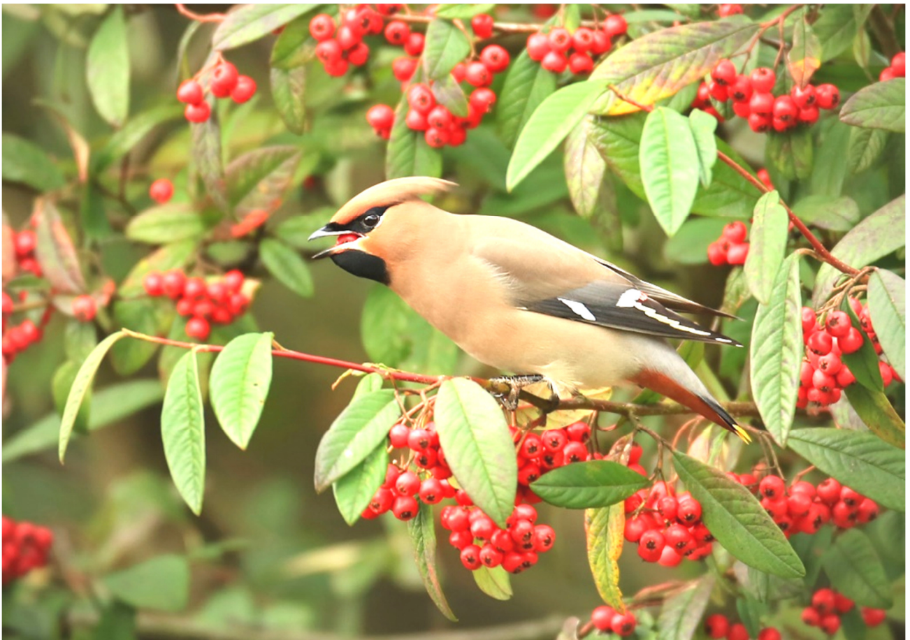
The aptly named Bohemian waxwing can often be found feeding on berry-laden fruit trees in supermarket car parks

Lewis Hooper, ecologist at Hampshire & Isle of Wight Wildlife Trust