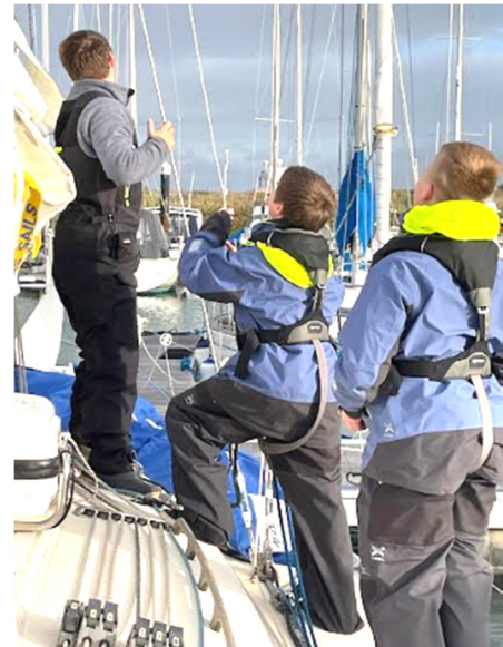
The Portsmouth / Isle of Wight sailing trip

One final note – none of this could have been done without the support of the local community, in so many ways. Although we are not going out of our way to find new guests any more, we still have family members who are suddenly able to come, or guests who need new hosts, due to host ill health or that they have come to the end of their six months. Could this be you? If it is, we'd love to hear from you – please get in touch via my email youth@moretolife.church .