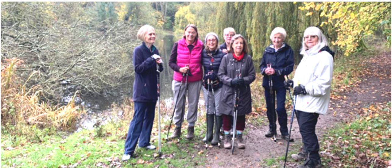
U3a Nordic walkers, pausing on their brisk and bracing walk

Despite the inclement weather many of our members have been flexing their muscles. Our intrepid Nordic walkers enjoy weekly brisk and bracing outings along the canal or across Odiham Common. Whereas the Walking for Pleasure group, which meet twice a month, always follow a circular walk beginning and finishing at a pub. A recent walk took them from the Duke of Cambridge in Tilford, across Tilford Green, then on to Hankley Common before returning via Hankley Golf course to the all-important pub lunch.