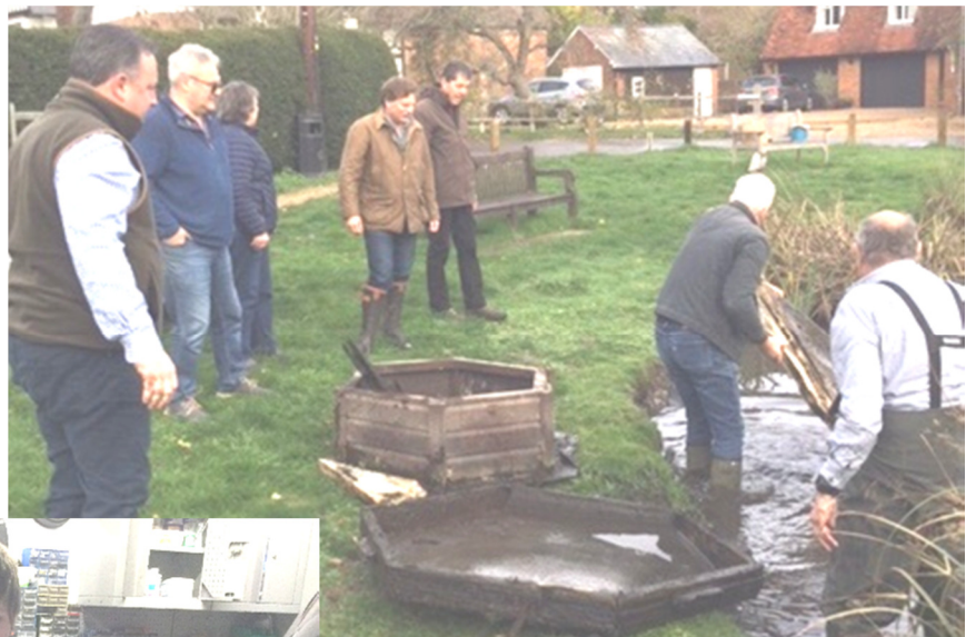
Removal of the old duck house