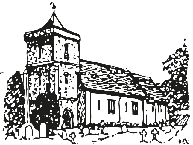
St. Mary's, Herriard