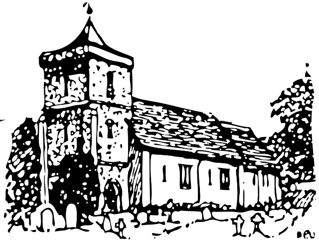
St. Mary's, Herriard