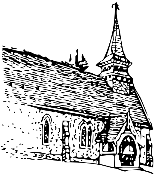
St. Lawrence, Westcott