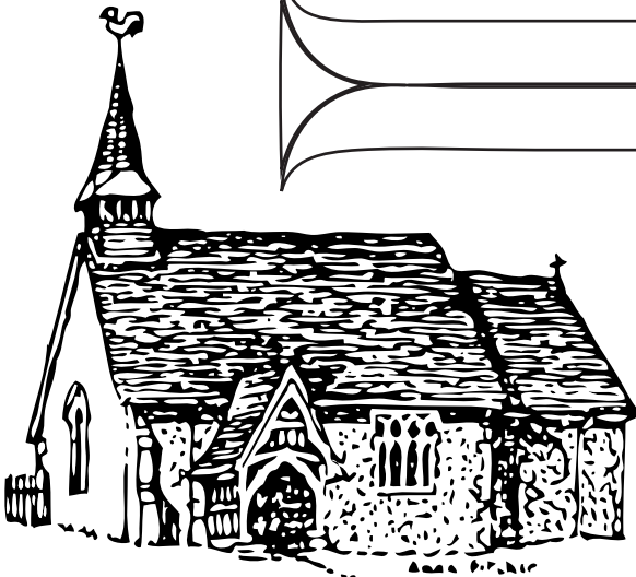
All Saints', Turworth