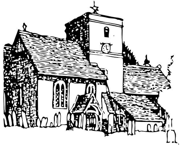
St. Mary's, Upton Grey