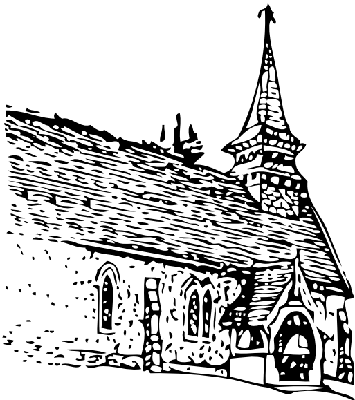
St. Lawrence, Westcott