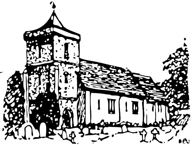
St. Mary's, Herriard