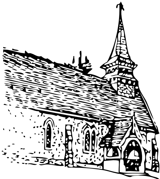
St. Lawrence, Westcott Parlick