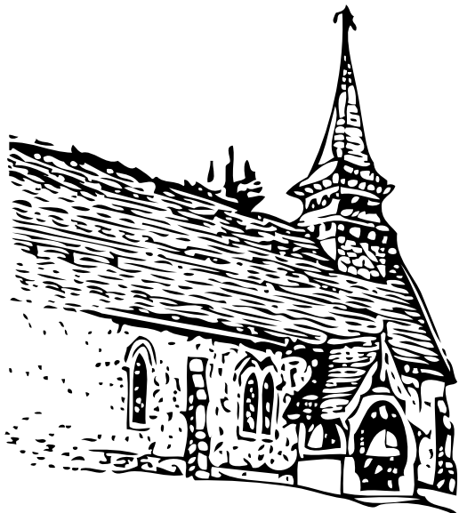
St. Lawrence, Westcott Parvick